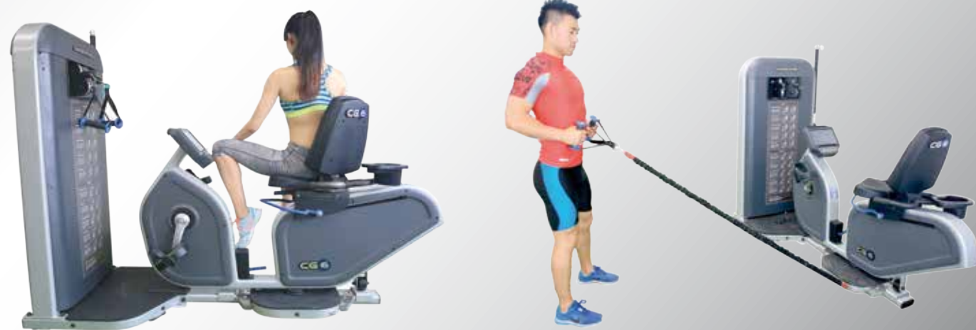
Optional Swivel Seat for Easy access