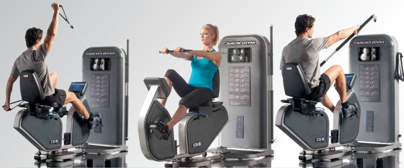
Forward Facing Exercises